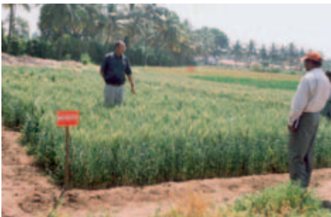
Fig. 29: "Tropicalized wheat". IARI variety HW 3070 is grown in Tamil Nadu, close to the equator. Note coconut and wheat growing in the same ecosystem.

The physical aspects of grain quality include external features, foreign matter presence, plant debris damage due to saprophytes,