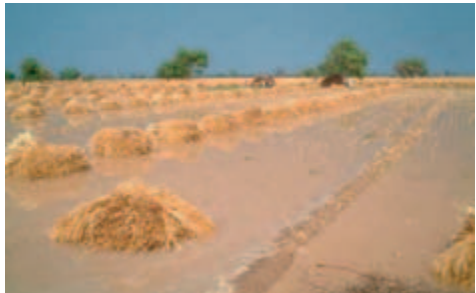
Yet another meaning of "rain fed": harvested wheat lying in a pool of rain water (2001)

There are more shrunken and broken kernels in the freshly harvested grain lots of Punjab, Haryana and the Plains of Uttaranchal, and to some extent in Uttar Pradesh where combine harvesting is common practice. In states like